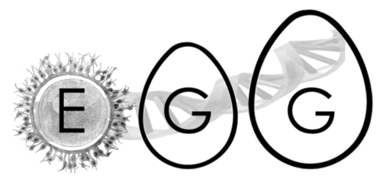
Figure 1. Logo's