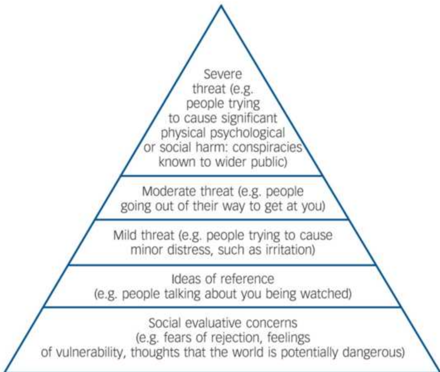
Figure 1. The paranoia hierarchy (Freeman et al., 2005)